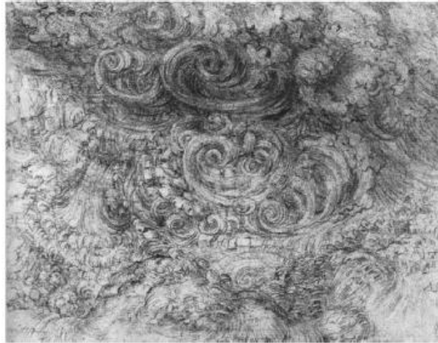
Figure 3 : Da vinchi, The Deluge (Kuhn 2009)

Nature seems to be full of complex self-similar patterns. This has been a source of inspiration for many artists throughout history. Leonardo da Vinci, an Italian Renaissance polymath, used a blotting technique to produce paintings that resembled self-similar clouds. One such event is the Deluge (Figure 3). (Frame et.al 2014). In his writings on water and sound waves, Leonardo da Vinci repeats the idea of self-similarity Sound travels in circles in the air like a stone thrown into water, becoming the centre and starting point for many more circles. Those who are put in the light air spread out in rings, filling the surrounding area with an endless likeness of themselves, and appear in every portion of the surrounding space.