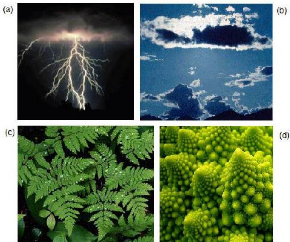
Figure 2 : Nature Fractals : (a) Lightning, (b) Clouds, (c) Leaves and (d) broccoli ( frame et. al. 2014)

Although lightning does not travel in a straight path, each smaller branch resembles the bigger one (as seen in Figure 2 (b)). This is seen in Figure 2(b), where the form of clouds is impossible to correctly characterise using Euclidean geometry. Another example of a self-similar structure is a fern leaf structure (Figure 2(c)), which consists of numerous tiny leaves that have the same form and structure. If you're looking for anything that looks like a conical broccoli, you'll find it in Romanesco (Figure 2(d)) (Frame, Mandelbrot & Neger 2014).