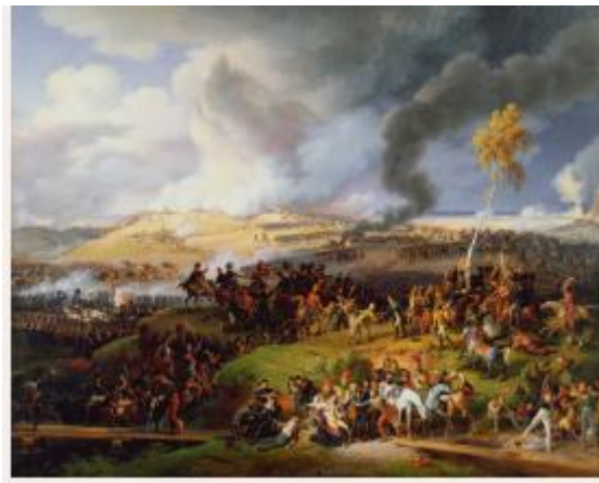
Painting depicting the Battle of Borodino