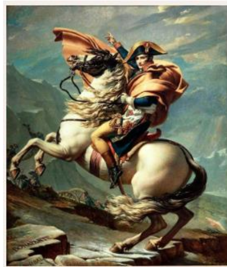
"Napoleon Crossing the Alps" by Jacques-Louis David

decisions and wants intersect with larger historical forces, which eventually have an effect on the path that nations take.