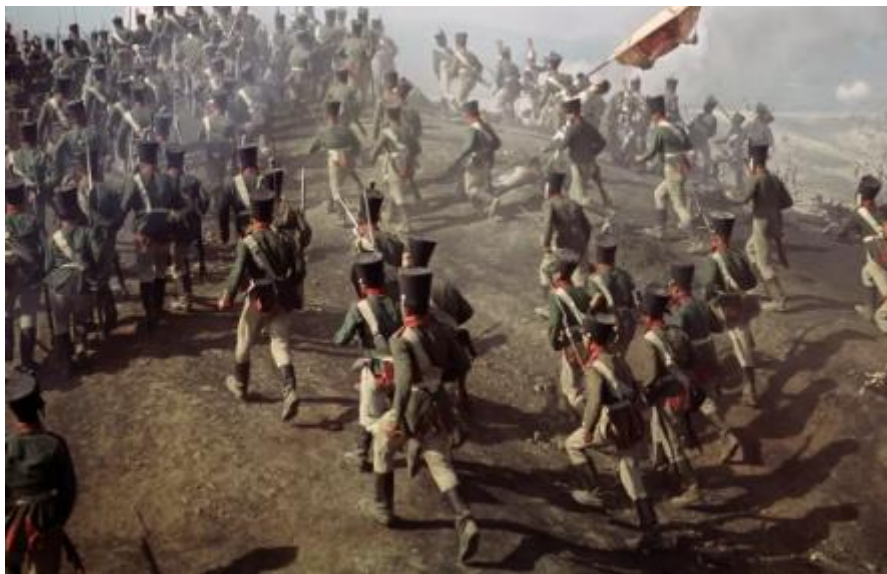
Tolstoy's 'War and Peace'

In spite of this, Tolstoy manages to showcase instances of empathy and compassion even in the midst of the turmoil and destruction. Characters like Pierre Bezukhov and Prince Andrei Bolkonsky are forced to face the reality of war head-on, and as a result, they struggle with negative emotions such as terror, disappointment, and moral ambiguity. As the protagonists strive to reconcile their beliefs with the harsh realities of fighting, Tolstoy demonstrates the toll that war takes on the human soul via the events that they go through.