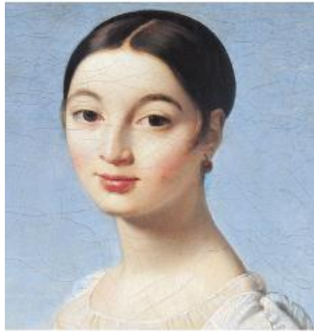
Examining the Themes of War And Peace – The Narrative ARC

to contemplate the repercussions of unbridled ambition and the pursuit of achievement in the world.